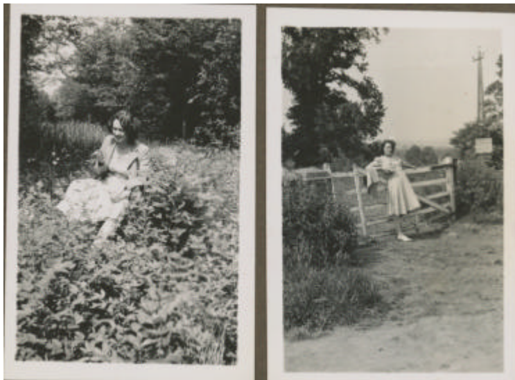
a day at Shriventham .1941 July.