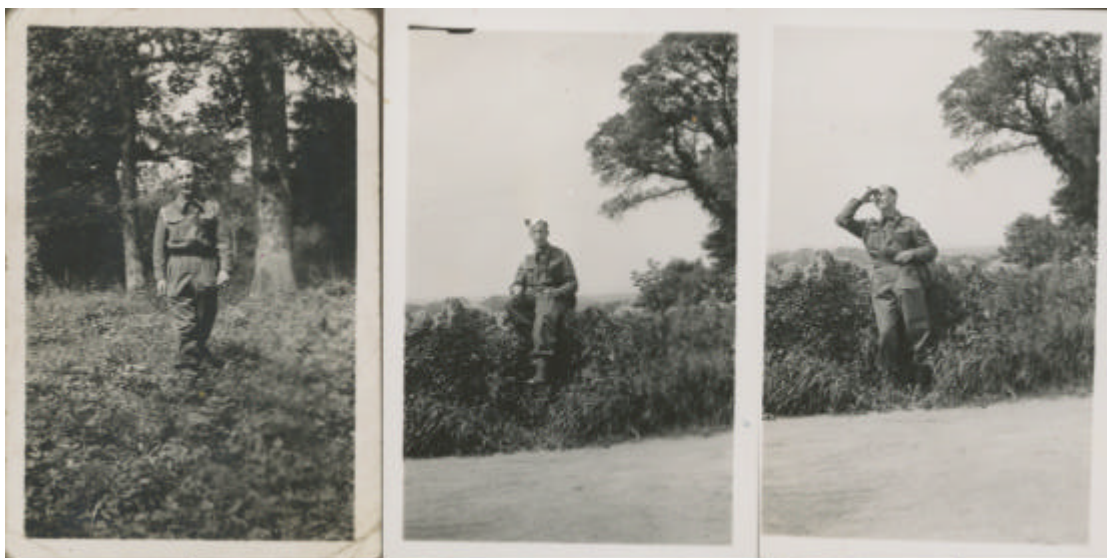
a day at Shriventham .1941 July